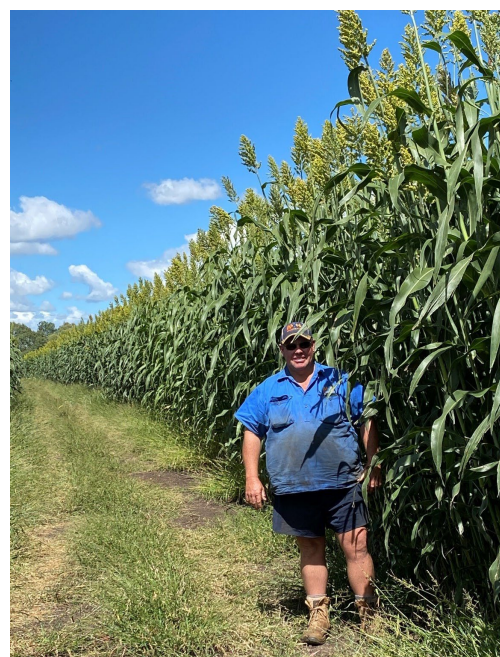
Figure 2: Sorghum (variety Megasweet) 70days after planting