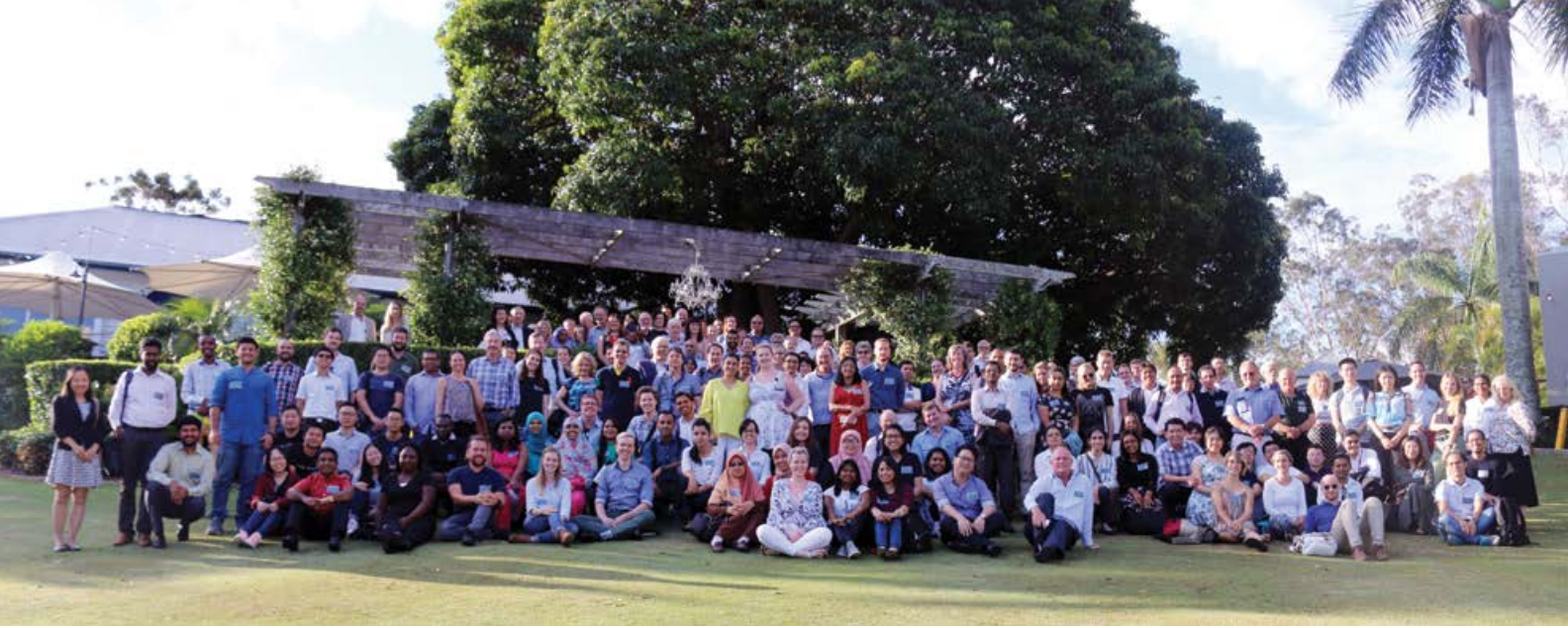
QAAFI staff congregate at the 2018 Annual Research Meeting on 20 November