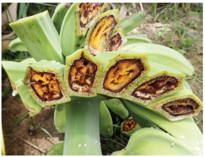
Banana blood disease

A better understanding of the disease will aid Indonesia's banana growers to reduce the impact of the disease. This will in turn reduce the risk to Australia and will allow for testing and validation of identification techniques developed in Australia – a win-win situation for all parties involved in the collaborations.