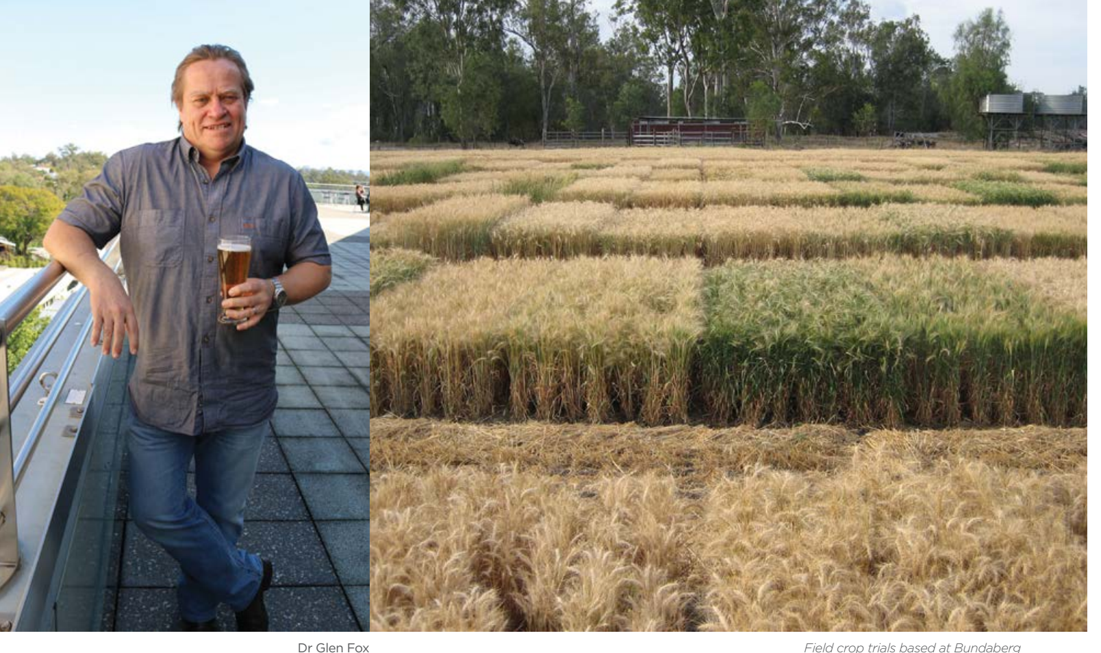
Field crop trials based at Bundaberg