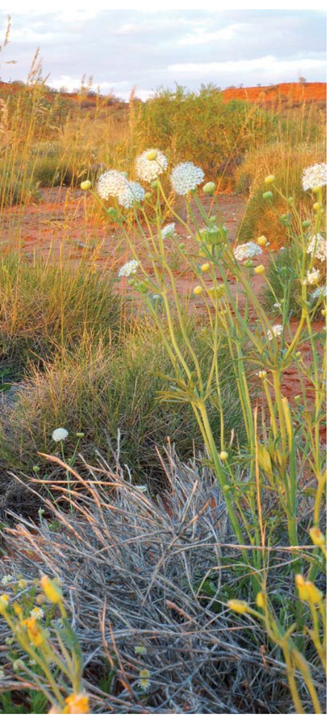
Wild parsnip growing in northern Australia

sequencing and analysis to guide rapid back-crossing.