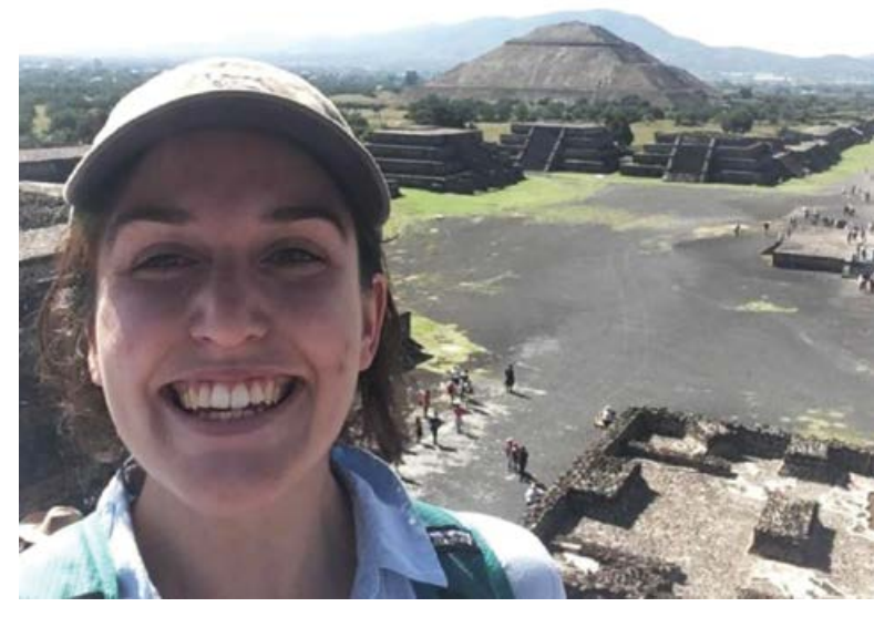
A selfie at Mexico's Sun and Moon temples of Teotihuacan

The results are highly promising, as they demonstrate the durability of the APR for both pre-breeding and multi-pathogen resistance breeding. Furthermore, this plant material is now available for experimental purposes at CIMMYT where further trials