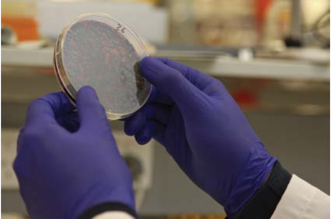
QAAFI offers world-class scientists and facilities

In food crops, we've made a difference with the laboratory propagation technologies we've developed to more efficiently propagate tree species, such as macadamia, mango and avocado, to allow rapid expansion of those industries. We've also improved the varieties of fruit trees.